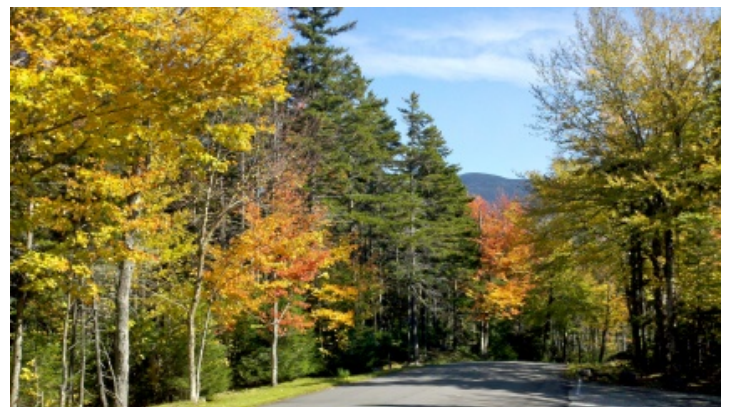
Looking out towards Mount Washington, near the Presidential Range.

nearly forty miles. All members of the group spotted moose along the trail. The club will definitely consider the Presidential Range for future trips.